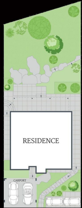
SITE PLAN (NOT TO SCALE) Approx Internal 266sqm Land Area 581.7sqm